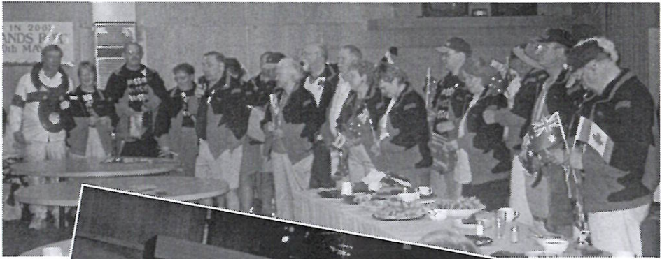
Top: David Cameron welcomes the Canadian visitors at the AGM